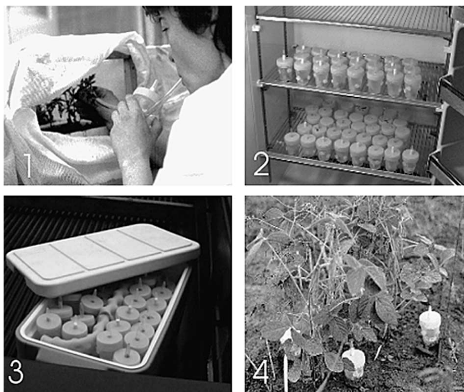
FIGURE 2. Different uses of the container: aspiration of Ophraella communa adults into the container (1); storage at low temperatures (2); transport to the field (3); and release in a soybean field (4).

Acclimation prior to storage. Containers with insects were placed for three hours in a refrigerator at 10^\circ\text{C} , and then for 72 hours at 5^\circ\text{C} . Containers were subsequently transferred to the low temperature incubator ( 3^\circ\text{C} , constant darkness). Ten containers were equipped with a water-saturated cotton wick (hereafter referred to as w-containers); the mean RH inside these containers was 95.7 \pm 2.9\% . The 10 remaining containers did not receive cotton wicks (hereafter referred to as nw-containers); the RH inside these containers was similar to