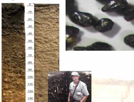
Terra preta "Normal" soil

The application of bio-char improves soil fertility by two mechanisms: (1) by adding nutrients to soil (such as K, to a limited extent P and micronutrients); (2) by retaining nutrients from other sources including nutrients from the soil itself. The main advantage is the second, the enhanced nutrient retention mechanism. In most situations, the bio-char additions have a net positive effect on crop growth only if nutrients from other sources such as inorganic or organic fertilizers are applied as well.