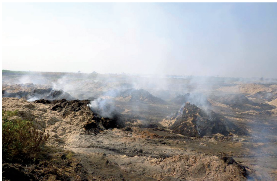
Figure 1 | Smouldering sugar cane in Kenya. Sugar cane bagasse residues are discarded and burnt as a waste removal strategy in western Kenya. These residues could instead be used as feedstock for biochar and thereby mitigate emissions from in-field burning.

The deficit in our understanding of the benefits that biochar can bring to crop yields and carbon storage stems in part from spatial and temporal constraints in the experimental set-ups used to study its effects. Much of what we know about crop yield responses to biochar additions arises from field experiments with at most 4 to 5 years of data, or from necessarily short-term glasshouse experiments. And most of our understanding of biochar turnover times stems from short-term laboratory incubations of only a few years. Long-term data on the turnover of substances comparable to some types of biochar do exist, most notably in the form of charcoal-rich soils in the Amazon Basin, termed terra preta , that have persisted for centuries to millennia. However, the applicability