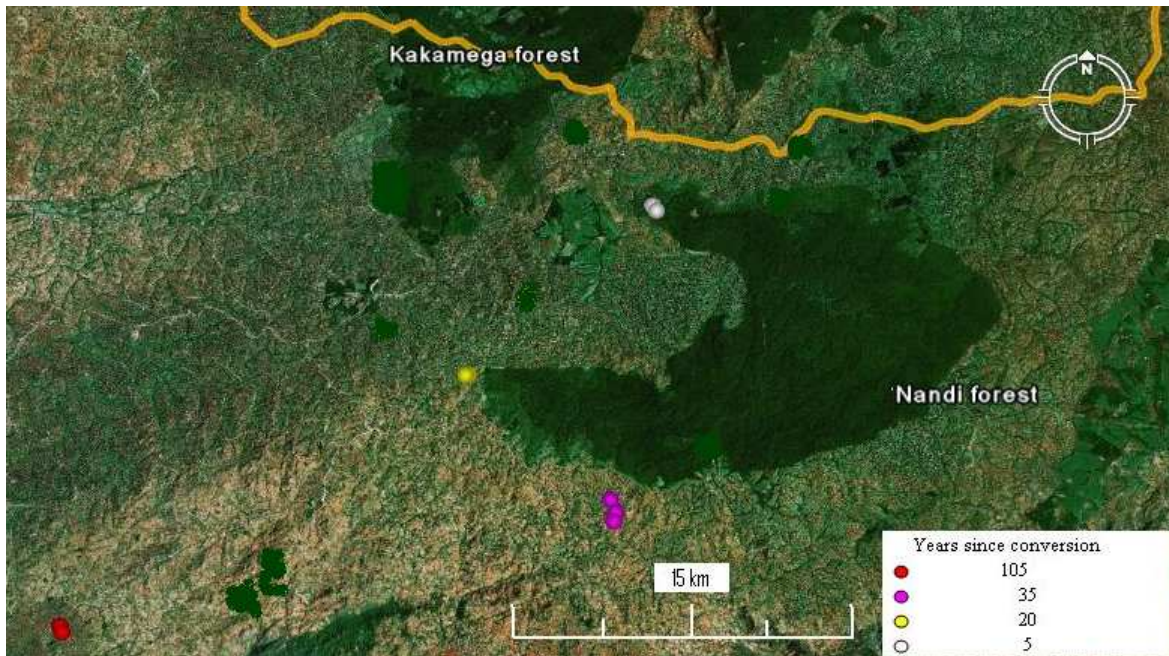
Accessory Figure 1. Geographical location of research sites across the study area in Western Kenya. The settlement corridor separating the once contiguous forest system is ~30 km wide hence the chronosequence sites have similar elevation, temperature and rainfall.